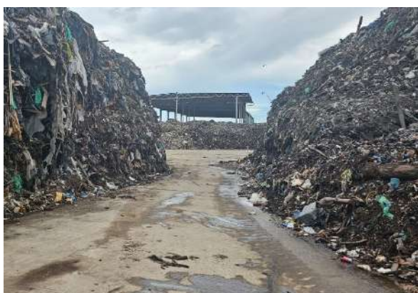
Figure 3: Waste piled in Thilafushi

Waste Management Corporation Limited (WAMCO) currently oversees waste management in Greater Male' region; including collection, transport, storage and disposal. 56 Thilafushi island is the main waste management facility in the country.