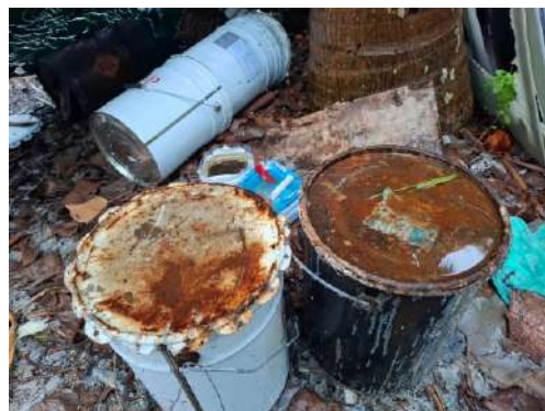
Figure 14: Rain water collected in discarded containers which becomes breeding grounds for mosquitoes

Another environmental issue exacerbated by the improper waste management or lack of thereof is the increase in vector-borne diseases in the island. The discarding of empty containers to various areas of the island becomes breeding grounds for mosquitoes, especially during the rainy season.