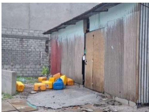
Figure 7: Temporary chemical storage facilities

It was also observed that chemicals are generally kept in the boatyards. In almost all boatyards visited, there were large barrels of containers in a haphazard manner around the