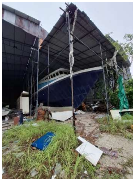
Figure 4: Alifushi boatyard

With the modernization of the sector, the skills and expertise of the experienced boat builders are being passed down from one generation to another, through continuous boat-building