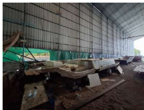
Figure 6: Mould made by FRP