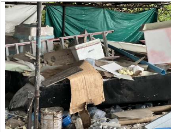
Figure 13: Waste discarded near the boatyard areas