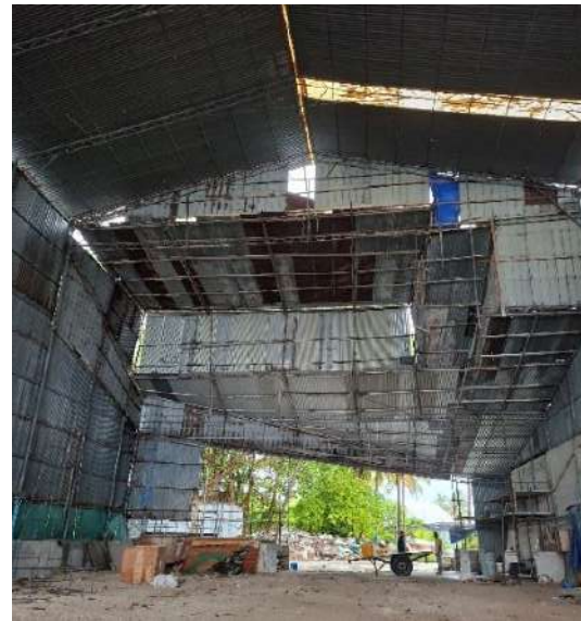
Figure 10: Absence of proper occupational and health features in boatyards