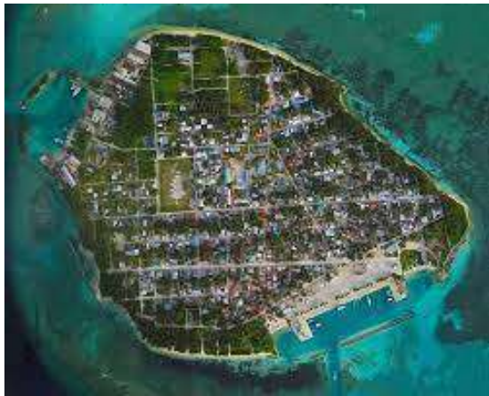
Figure 2: R. Alifushi

This case study focuses on the island of Alifushi, situated in North Maalhosmadulu Atoll of the Maldives at an approximate geographic coordinate of 5°58'00.87"N and 72°57'11.90"E. 11