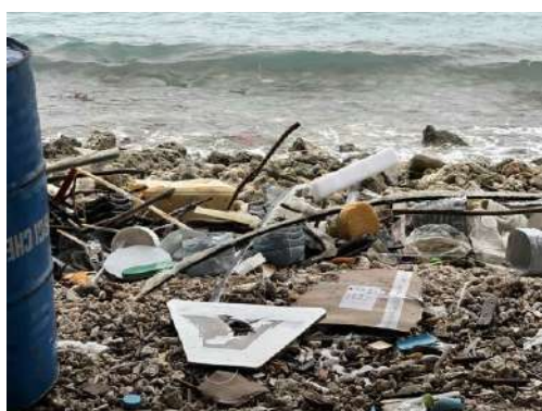
Figure 12: Waste dumping near the ocean coastline