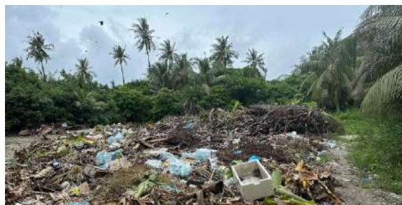
Figure 1: Waste piled in the waste disposal area of HA. Thakandhoo, Maldives

The management of such waste in the Maldives is challenging due to lack of land availability, low-lying land, complexity and cost of transporting waste between islands, insufficient regulatory frameworks and lack of financial mechanisms to promote sustainable chemicals management. 9 Additionally, the lack of economies of scale hinders establishment of national-level recycling and disposal solutions, including hazardous waste and chemicals. Furthermore, the country's susceptibility to climate-related events and ocean