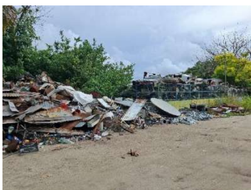
Figure 11: Waste dumping in Alifushi IWMC and nearby areas

However, due to overaccumulation of non-disposable waste, the areas adjacent to the IWMC and areas close to the boatyards are also currently used as waste dumping areas. This includes empty chemical containers, fibreglass waste, discarded moulds, plastic bottles and metal waste. Unlabelled containers of chemicals were also found left in open air in and around the boatyards. Waste was also observed to be dumped near the coastline, areas known for eroding, which would ultimately result in the waste ending up in the ocean.