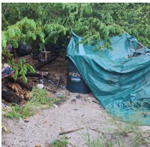
Figure 9: Chemicals stored under tarp in boatyard

The Rural Youth Vocational Training Centre (RYVTC) was established in Alifushi around the 1980s as a specialized centre for conducting boat-building training courses. This Centre was later renamed as Regional Youth Vocational Training Centre (RYVTC). 92 Following the restructuring of the Technical and Vocational Training (TVET) system in the Maldives, the training centre