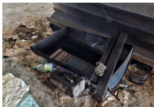
Figure 8: Chemical Stored in Boatyards