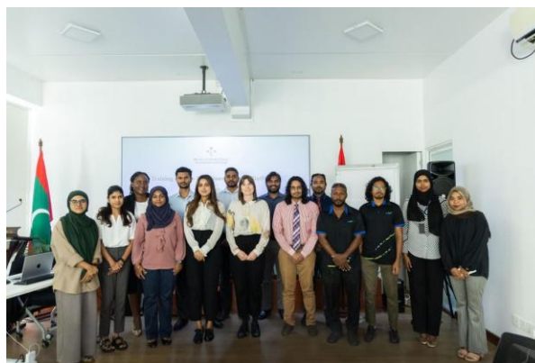
Figure 1: Participants of the 5-day workshop on the Low Emissions Analysis Platform LEAP.

During December 8-12, 2024, Stockholm Environment Institute conducted a 5-day workshop on climate mitigation planning using the Low Emissions Analysis Platform (LEAP) for climate mitigation and energy experts in the Maldives. The objective of the training was to strengthen the Maldives' capacity to track greenhouse gas (GHG) emissions and mitigation efforts, supporting the country to meet its reporting obligations under the Enhanced Transparency Framework (ETF) of the Paris Agreement. The training was offered by the Ministry of Climate Change, Environment and Energy (MCEEE) and is part of the broader Capacity Strengthening for Improved Transparency of Climate Change Mitigation and Adaptation Actions in the Maldives (CBIT Maldives) project, funded by the Global Environment Facility (GEF) and supported by UN Environment.