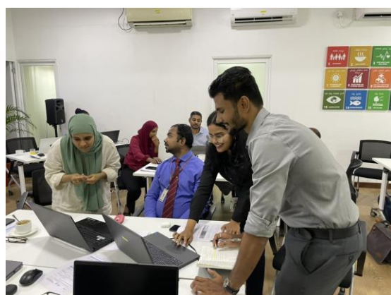
Figure 4: Participants discuss during interactive group sessions.

The fourth day centered on the Maldives' LEAP model, which was developed for the recently published Biannual Transparency Report and features a complete energy systems model for the Maldives. After presenting materials on climate mitigation and energy systems planning in other Small Island Developing States, trainers familiarized participants with the model, highlighting methods, data sources, and results. Participants then explored the dataset through practical exercises, working collaboratively on scenario and policy explorations, and implementing alternative scenarios, further refining their skills in LEAP.